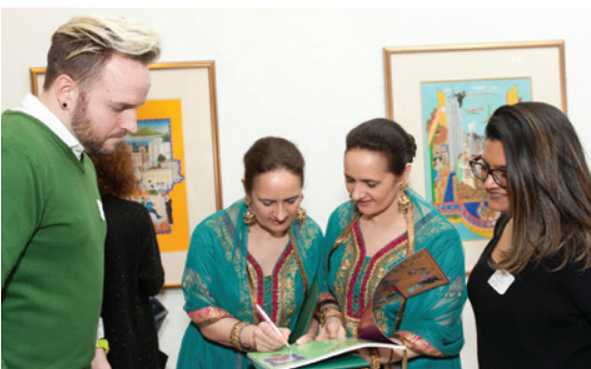
The Singh Twins at the VIP event. Admirers lined up for selfies and autographed catalogues.