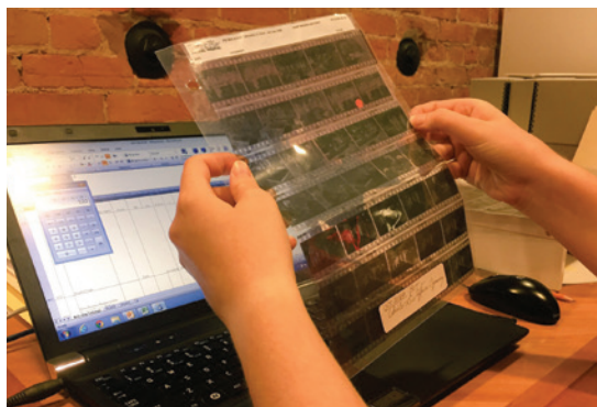
While gaining practical experience in their chosen field, students and interns provide the Archives at PAMA with valuable assistance with collections and research.

With funds generously provided by donors during the 2015 Annual Campaign, the Archives launched a project to digitize 19 reels from its moving image holdings. Digitization supports preservation of the originals and expands opportunities to share rare footage through social media and exhibits. The Archives digitized footage of streetscapes, scenes and events across Peel, along with rare footage of the AVRO Arrow.