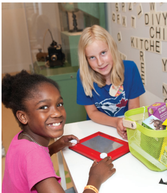
Young visitors fascinated with the exhibition Canada at Play: 100 Years of Games, Toys and Sports on loan from the Royal Ontario Museum.