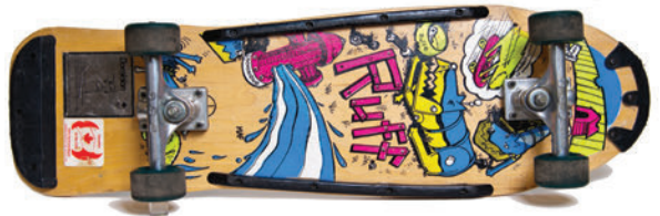
Collecting now for the future to share values, trends and fads with future generations. Dominion Skate Co. Ruff skateboard, about 1980.