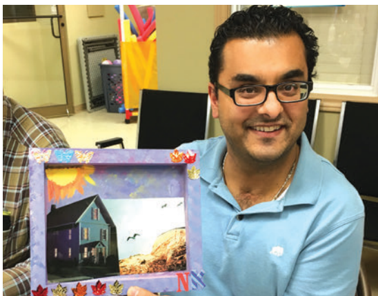
A participant from Peel Halton Acquired Brain Injury Services (PHABIS) the Creative Expressions program.

Creating is more rewarding when you have great partners. PAMA engages and collaborates with partners to increase engagement and create innovative programs that help build understanding and cohesion in the community.