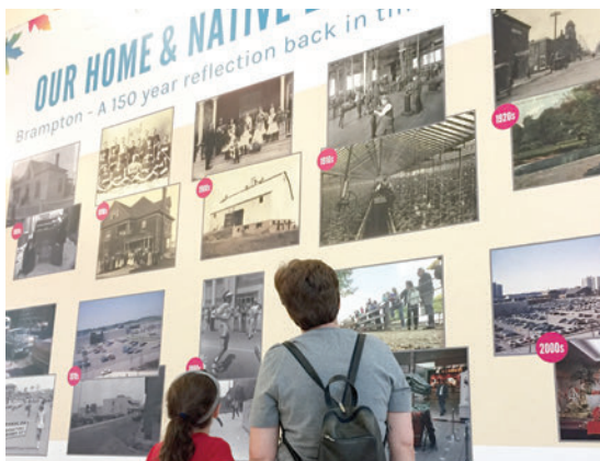
Archives images celebrating Peel 150 on display at the Bramalea City Centre in the summer of 2017.