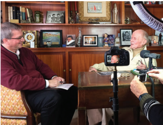
A Canada 150 Legacy Project for the Archives included a video interview with Brampton resident, the Honourable William Davis, former Premier of Ontario.

As the official repository for archival records generated by the Municipalities of Mississauga, Brampton and the Town of Caledon, the Archives enhances Peel Region's research capacity. The Archives also acquire and conserve records of individuals, families and organizations in Peel. Reference services are a core function of the Archives and the public reading room supports the work of genealogists, researchers, historians, students and municipal staff.