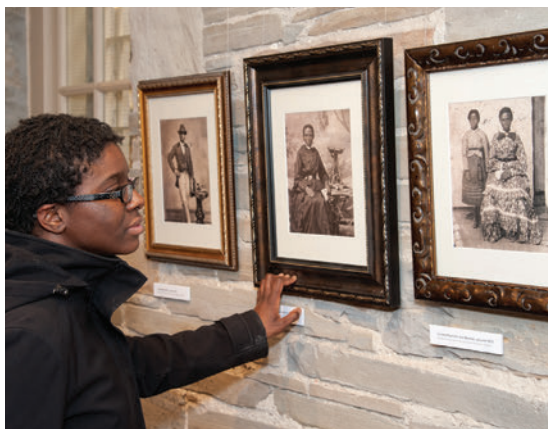
Black Enslavement in Upper Canada explored the history of slavery until it was abolished in the British Empire on August 1, 1834.