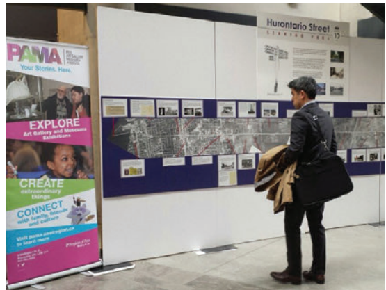
Hurontario Street: Linking Peel became a popular outreach exhibition in 2017. The exhibition travelled to the Mississauga Leadership Conference at Living Arts Centre.

Contributing to the goal of an accessible collection, the Archives managed several conservation projects throughout the year. A professional conservator was hired to stabilize several photographic collections in 2017.