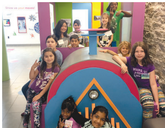
Students enjoy an educational ride at PAMA. In 2017, 8,145 students visited PAMA and 1,161 student took part in outreach programming.

PAMA offers an array of school programming that connects curriculum to our collections in history, social studies, visual arts, science, technology and language. In 2017, a growing number of students were introduced to exhibitions and had the opportunity to engage with unique learning and hands-on experiences.