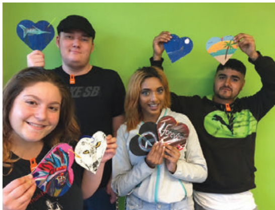
The Learning Fund, through generous donations received from Giving Tuesday donors, gave students from Peel Alternative School North the opportunity to create a Heart Garden at PAMA.