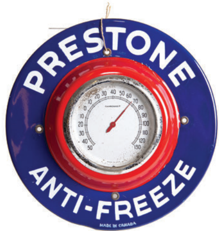
Material from W. J. Stubbs & Son, Caledon, an automotive repair business that was in business for decades.