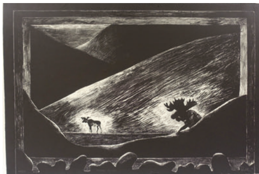
One of the 56 works donated by artist Charles Pachter, Canadian (b. 1942) Moose Opera , 1974 Lithograph on paper 10/50 Gift of the Artist

Michael Awad. PAMA Courthouse features a day in the life of the buildings that make up the PAMA campus, while View from the Cupola provides a panoramic view of downtown Brampton.