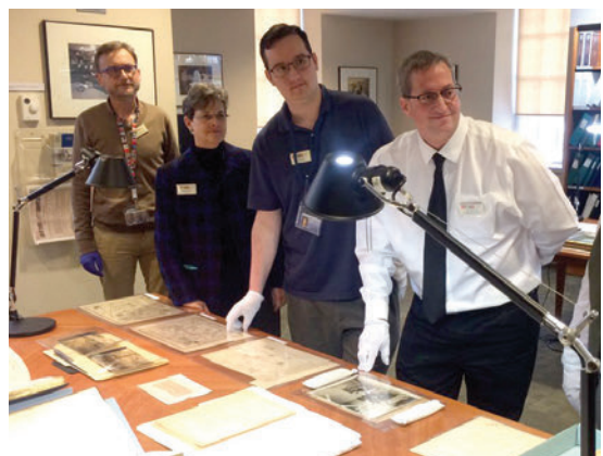
William Perkins Bull Historic Collection finds a permanent home at the Peel Art Gallery, Museum and Archives.

Several tightly curled rolls of 35 mm film negatives that had been stored in metal canisters for decades document some of the London Blitz, a German bombing offensive against Britain, and wartime life in different parts of England during the Second World War. These never-seen images document a decisive chapter of 20 th century history and, thanks to conservation, are now available for research by the public.