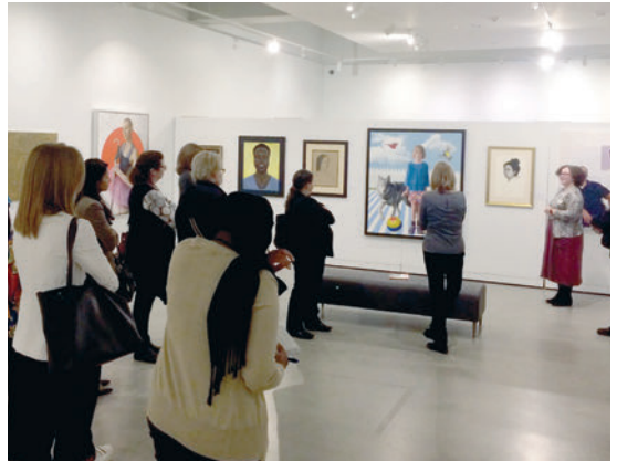
Exclusive events and programs for members continued in 2017 with tours of the Archives and new exhibitions.

The membership program continues to grow and provide benefits to our members, while helping to support several free admission days including Family Day and Culture Days. Our members also help to fund popular seniors' outreach programs, Museum Memories – Reminiscing for Seniors and Young at Heart . Both programs bring PAMA collections to those living in seniors' residences and assisted living centres. A portion of membership funds also supports the Creative Expressions program for those in the community facing physical, emotional and developmental challenges.