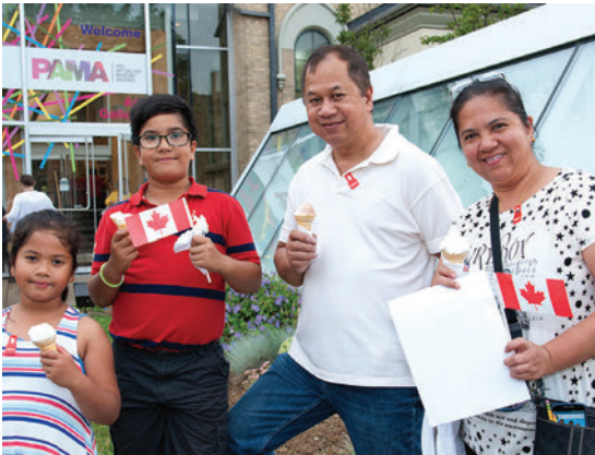
The Peel 150 opening included a ceremonial smudging to open the exhibition, music performances, art and, of course, ice cream!

PAMA offers programs designed to inspire and engage with audiences of all ages. The year 2017 was a year full of Family Fun Days, Summer Camp, Staycation Days, musical performances, artist and curator talks, art workshops as well as exciting March Break, Winter Break and Family Day programs.