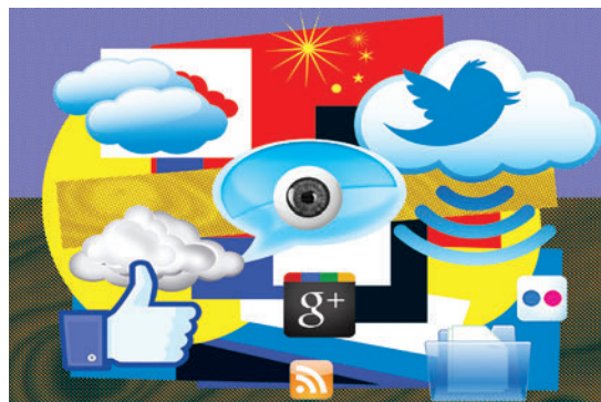
Douglas Coupland, Canadian, b. 1961 The Cloud , 2013 Archival pigment print on paper Purchased from Douglas Coupland with funds from the David Somers Works on Paper Endowment ©the artist

The Cloud , 2013 by Douglas Coupland, Canadian, b. 1961