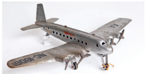
Toy DC-4 airplane made from pressed steel, late 1940s. Gift of Mississauga Community Support.