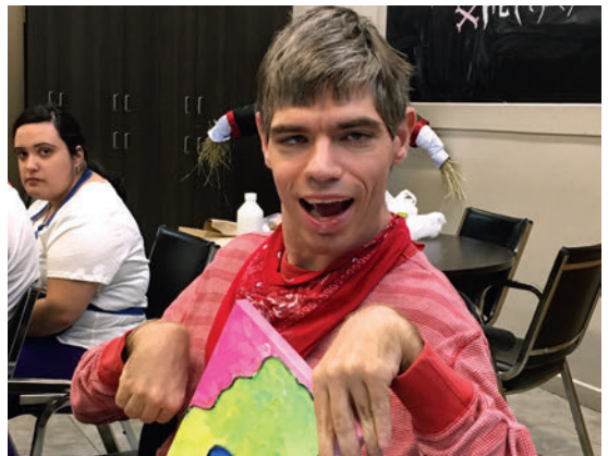
Participants of the Creative Expressions program leave each session with an art piece they have created and a sense of pride in their abilities. Thanks to increased funding, PAMA could expand and deliver the program to more locations than ever before.