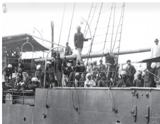
Passengers aboard Komagata Maru, 1914. The exhibition explored the tragic journey of the Komagata Maru. In 1913, the ship was refused entry at the Port of Vancouver. In 2016, the Canadian government formally apologized for the incident.

Thanks to sponsorship from the Sikh Foundation of Canada, PAMA was able to offer free admission to visitors in April 2017. The Foundation's support also allowed PAMA to curate two exhibitions to be part of the Peel 150 celebrations. Komagata Maru: A Journey to Canada exhibition included historic photographs to document a 1914 voyage of Sikh and Indian immigration. Kings and Saints: A Legacy in Sikh Art allowed visitors to connect with Sikh art and artifacts, drawn from private collections in the GTA.