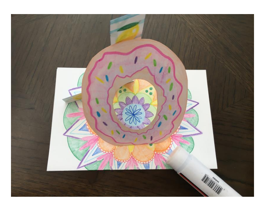
This activity is provided to you by:

Transform your letters into a 3-dimensional sculpture by folding a small part of the bottom of each letter and gluing them together on a folded piece of cardstock that will be your base and share who you are with those around you.