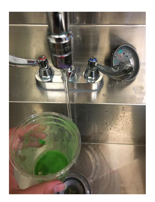
This activity is provided to you by: