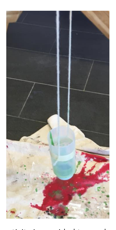
This activity is provided to you by:

Use tape and string to hang your squeeze bottle with the open end facing-up from the centre of your pendulum base. Be sure your bottle/cup is level.