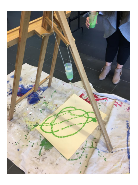
This activity is provided to you by:

As your bottle swings with its weight, the paint will pour out of the bottle and onto your paper. As the swing starts to slow, you can gently pull it aside again and push it in a different direction to get a different effect on your paper.