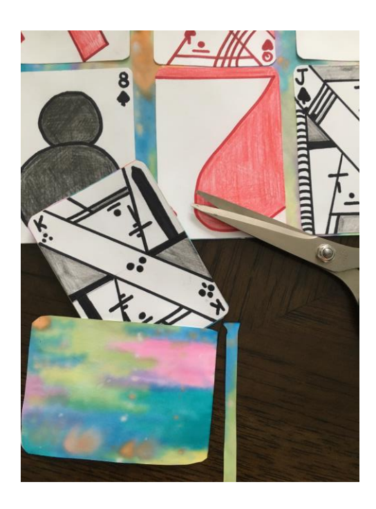
This activity is provided to you by:

Use your scissors to carefully cut around each card. Once all your cards are cut, you might need to place them under a book or something heavy to flatten them.