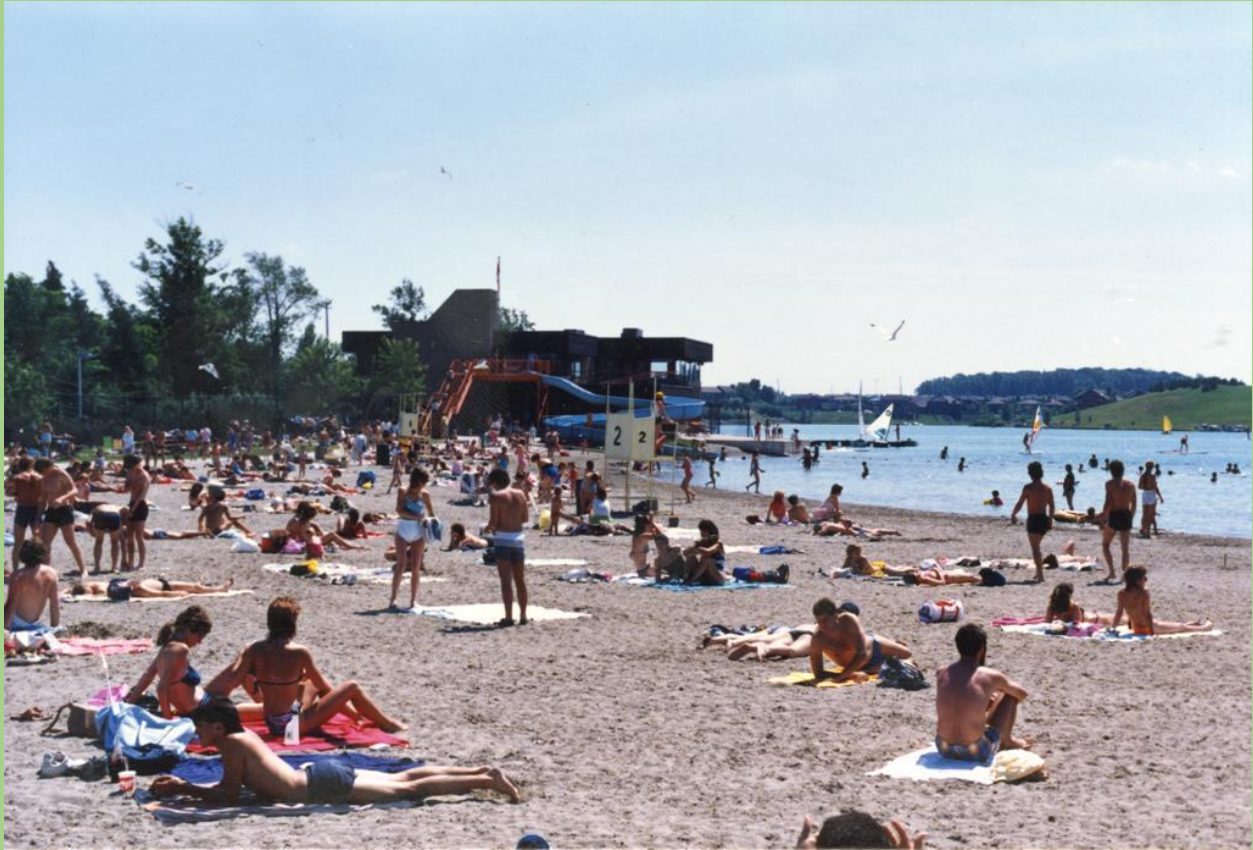
Beach goers at Professor's Lake, ca 1988

Do you dream of the beach all summer long? Pictured here is an image of the beach at Professor's Lake in Brampton from 1988. Check out the eighties swim fashion! Professor's Lake was once used as a gravel pit. Between 1954 and 1973, over 20 million tonnes of sand and gravel were extracted from this spot. Eventually, water came through the pit and a lake was created. Nowadays the lake is used for water recreation.