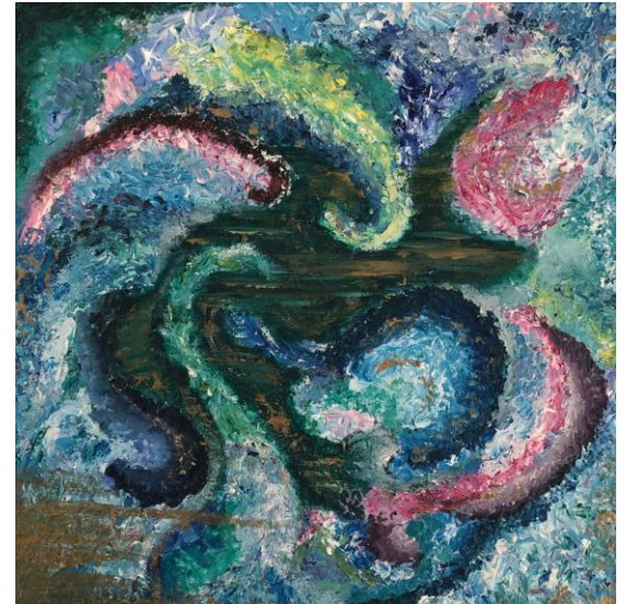
A. Sattaur, underlying uncertainties, 2020, acrylic on canvas.

Get inspired by the geometric shapes and colours of the Mayfield student's paintings in PAMA's online exhibition Home: Expressions in Abstraction.