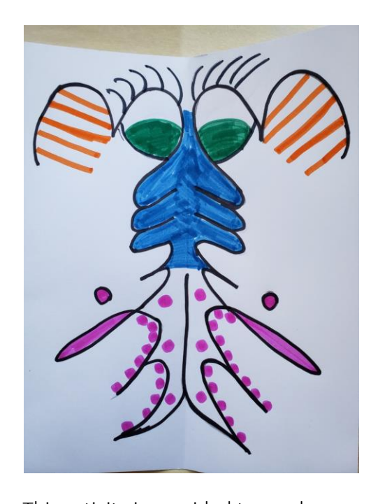
This activity is provided to you by:

Turn your page vertically and use your imagination to look for the elements of your creature, eyes, a nose, a mouth. Using markers/pencil crayons/crayons, colour-in your creature. Be sure to use symmetry and colour both sides of your paper the same. To finish it off, don't forget to give your creature a name.