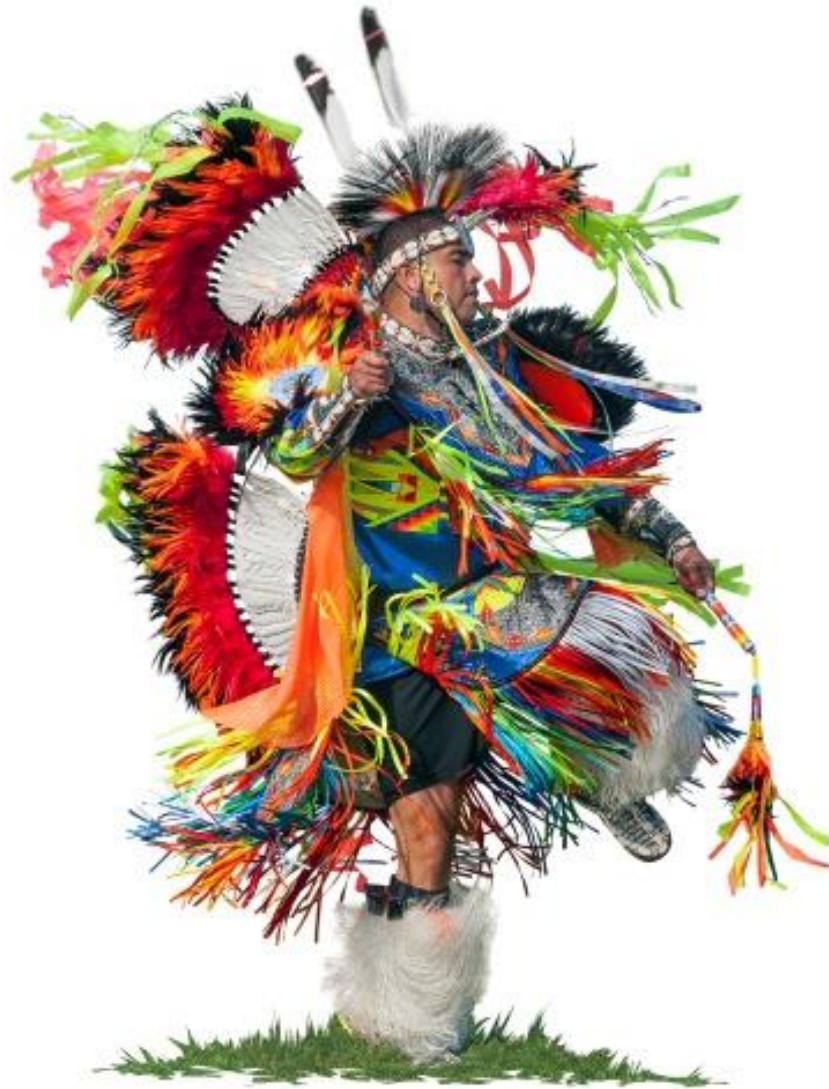
Derek Martin – Mohawk, Six Nations of the Grand River, Ontario

The twenty-two vibrant photographs from the REGALIA: Indigenous Pride exhibit capture the movement and beauty of powwow dances while highlighting the sacred and traditional clothing worn. You can incorporate colour and movement into your own art while making figures in motion collages! To learn more, visit REGALIA: Indigenous Pride at PAMA from July 2 nd to October 30 th , 2022!