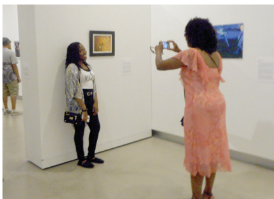
Proud parents snap photos of their student artists at the opening of Walk the Art .

In partnership with the Peel District School Board, PAMA hosted the annual exhibition of student work entitled Walk the Art . Artwork