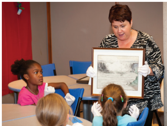
Kids get a chance to learn, create and develop a passion for art and heritage @ PAMA

PAMA's school programs enhance the provincial curriculum while also helping to build our future audiences. Our wide-ranging collections and exhibitions serve as imaginative points of departure and inspiration for our school programs that are meant to encourage students to engage, explore and connect with their inner creativity and their communities.