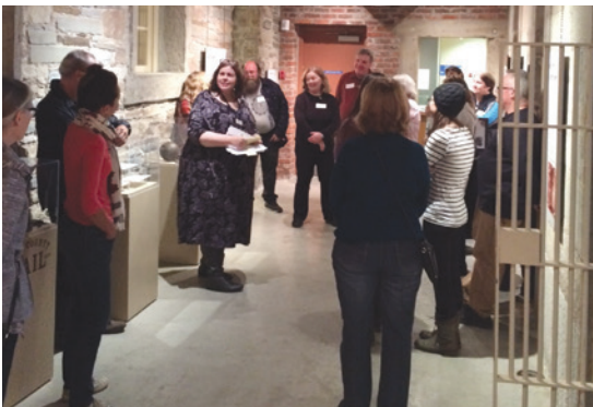
The Secrets and Scandals tours were a hit with audiences. Sold out tours in 2016 mean they will be back with more stories from the vaults in 2017.

Thanks to generous funding provided by the Brampton and Caledon Community Foundation, many youth and adults were able to take part in our Creative Expressions workshops. Designed for participants with special needs, this program enables participants to develop skills and confidence through the creative process.