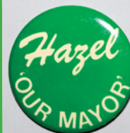
Hazel McCallion campaign button from late 1970s or early 1980s.