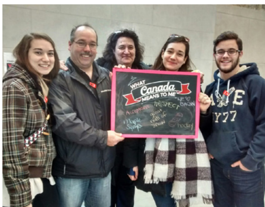
Visitors to PAMA were asked to comment on the question, What does Canada mean to you?