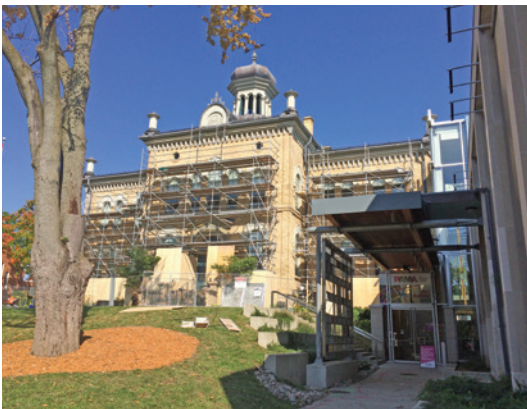
Hoarding on the front of the courthouse allowed for the repair and refurbishing of the wooden sash windows .

The Historic Courthouse had a facelift in time for its 150th birthday in 2017. The wood sash windows were repaired, re-caulked and repainted.