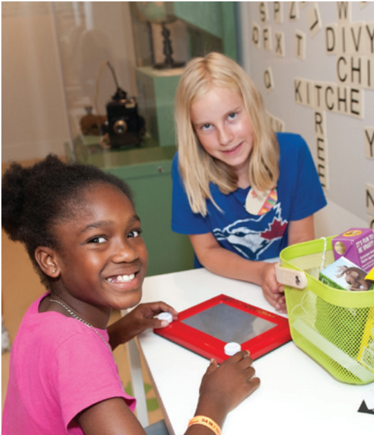
Young visitors fascinated with the exhibition Canada at Play: 100 Years of Games, Toys and Sports on loan from the Royal Ontario Museum.