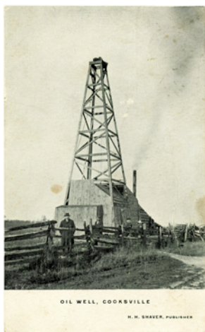
Oil well, Cooksville, 1908 (PN2016_01591)