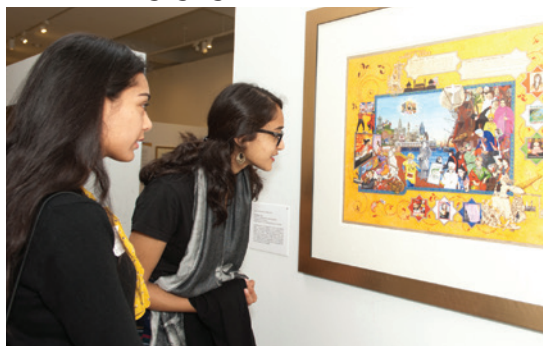
The Singh Twins opening Retrospective in the spring of 2016.

Our aim for art exhibitions remained focused on community engagement and working with a spectrum of partners to produce and present excellent, engaging exhibitions.