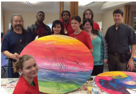
Students and artist worked together to create an amazing series of artworks representing the seven Grandfather Teachings.

In 2016, our education department delivered 284 programs in the facility and out in the community.