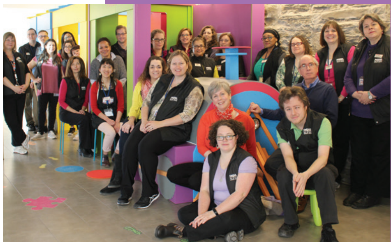
PAMA staff in the Kids on the Move exhibition