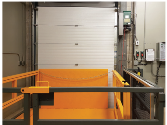
The new scissor lift in the art gallery loading area provides a safe way to handle large works of art.