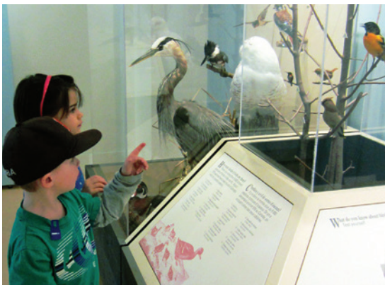
Visitors explore Our Feathered Friends exhibition on loan from the Canadian Museum of Nature

In addition to the host of exhibitions in 2016, the Museum team developed numerous interactive activities designed to engage with visitors. Visitors were invited to comment, answer questions, or leave suggestions. These opportunities allowed them to participate in the exhibition and to share their comments with other visitors. Their remarks were collected and collated by staff to inform future exhibition planning, including Peel 150: Stories of Canada in 2017.