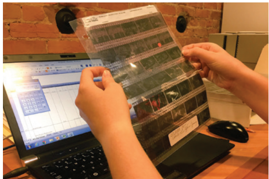
While gaining practical experience in their chosen field, students and interns provide the Archives at PAMA with valuable assistance with collections and research.

With funds generously provided by donors during the 2015 Annual Campaign, the Archives launched a project to digitize 19 reels from its moving image holdings. Digitization supports preservation of the originals and expands opportunities to share rare footage through social media and exhibits. The Archives digitized footage of streetscapes, scenes and events across Peel, along with rare footage of the AVRO Arrow.