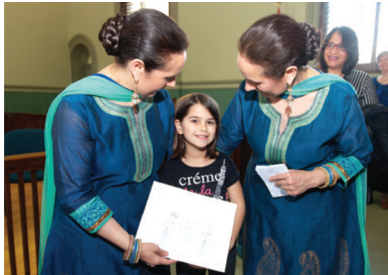
Talks by artists provide the public with the opportunity to hear about the creative process. The sellout crowd for The Singh Twins provided an opportunity for the artists to interact with visitors.