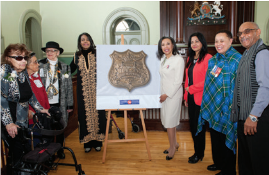
Family and dignitaries gathered to unveil the commemorative Canada Post stamp recognizing the No. 2 Construction Battalion.